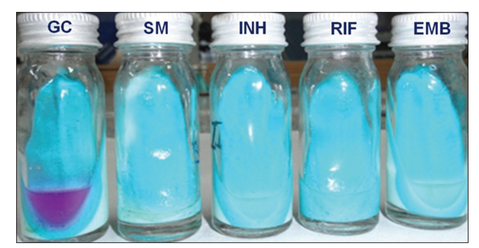
Figure 1: Demonstration of nitrate reductase assay results: Sensitive to all tested drugs. GC: Growth control tube without any drug, SM: Growth sensitive to streptomycin, INH: Growth sensitive to isoniazid, RIF: Growth sensitive to rifampicin, EMB: Growth sensitive to ethambutol