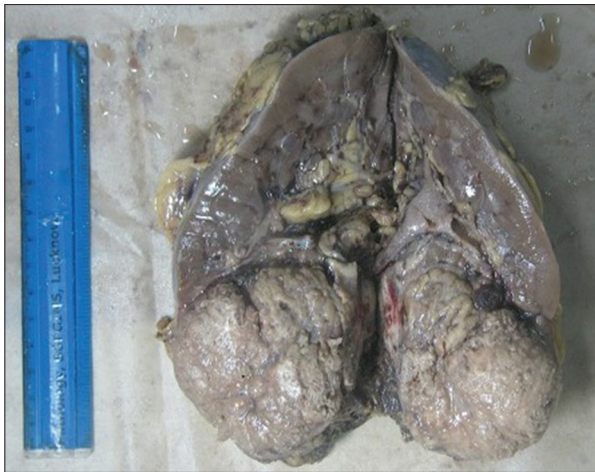
Figure 1: Gross appearance of tumor arising from the lower pole of kidney: A well-circumscribed mass with areas of necrosis and focal hemorrhages