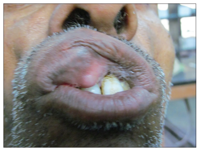
Figure 1: External clinical photograph. Cystic mass in the upper lip