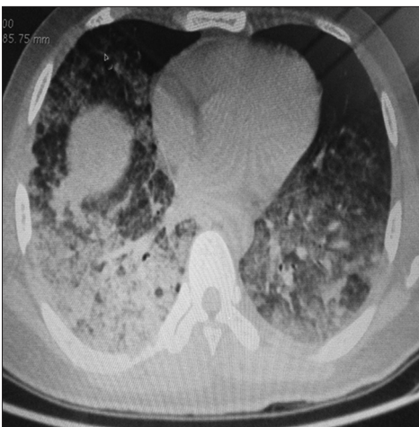
Figure 1: Computed tomography of chest revealing bilateral air space consolidation, ground glass opacities, bilateral parenchymal lesions suggestive of bilateral pneumonitis

As both C. neoformans and influenza virus can present with meningeal symptoms, it is essential to diagnose the primary pathogen so that a proper treatment in proper time can be instituted. Hence, this case highlights the fact that an AIDS patient is a microbiological zoo and all the