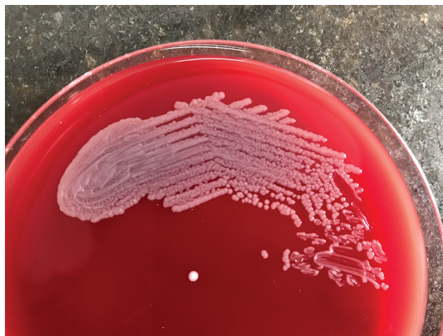
Fig. 2 Growth of smooth, circular, grayish-white, nonhemolytic colonies on blood agar.