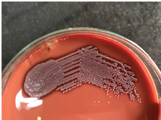
Fig. 1 Growth of smooth, circular, grayish-white colonies on chocolate agar.

The CSF was slightly turbid with TLC 427 cells/ \text{mm}^3 , DLC N96L02M02, glucose < 3 mg/dL, and protein 167 mg/dL. The CSF Gram stain showed few pus cells and plenty of short slender Gram-negative bacilli. On the next day (day +1), chocolate agar showed heavy growth of 1 to 2 mm smooth, circular, grayish-white colonies (►Fig. 1), grayish-white, nonhemolytic colonies on blood agar (►Fig. 2), and nonlactose fermenting semitranslucent colonies MacConkey agar (►Fig. 3). The isolate was Gram-negative bacilli, both catalase and oxidase positive and nonmotile. The neonatologist was