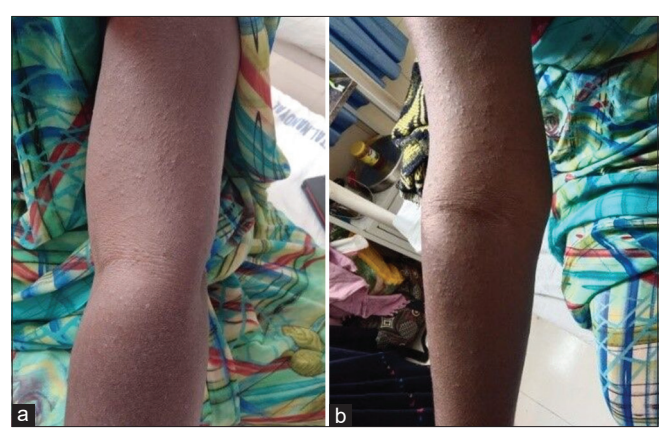
Figure 3: (a) Pyrazinamide induced rash (b) Rash view

A female patient aged 40 years had a persistent cough, fever, anorexia, and loss of weight for the past month. Her sputum was positive for acid-fast bacillus, confirming TB, and prescribed ATT. After two months of the intensive phase of ATT, in the third month (beginning of the continuous phase), she complained to the dermatologist of redness, and itchy rashes on both the hands and backside for one week, and eventually rashes had spread to the whole body [Figure 3]. ATT was withheld abruptly. This case was managed by administering tablet deflazacort (6 mg once daily) and tablet diphenhydramine 50 mg (antihistamine) for one week and topical mometasone (steroid) ointment and FA supplementation was given to protect against TBLI by daily administration of INH and RIF. Rechallenge with ATT drugs sequentially at one week intervals was required to confirm ATTinduced maculopapular rash. In the first week, a rechallenge was done with RIF, then in the second week, INH was reintroduced,