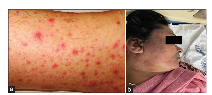
Figure 2: (a) Close view of rash (b) Rifampicin induced rash.

A young woman aged 49 years, with pulmonary TB, was under the ATT regimen for the past five weeks. In the following week, she consulted a dermatologist, complaining of red rashes, intense itching, and light swelling on her face and lower limbs for a week. Erythematous maculopapular rashes on the face and legs were seen on clinical examination [Figure 2]. She had no preexisting cutaneous disorders or other relevant medical history of antitubercular drugs, which were withdrawn instantly. Systemic steroids (Hydrocortisone), antihistamines (tablet diphenhydramine), and topical emollients were given for symptomatic relief, and FA supplementation was given to protect against TBLI