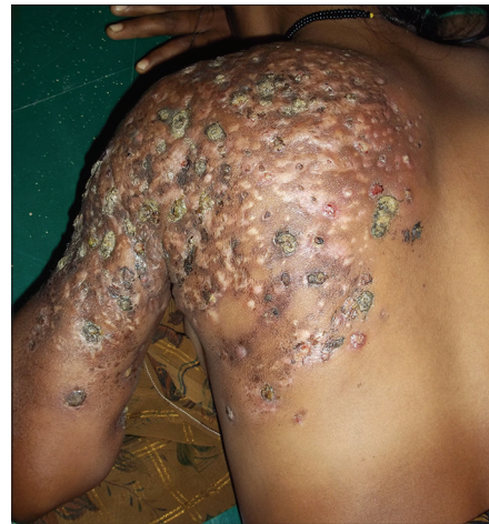
Figure 1: Multiple nodules and discharging sinuses around the left shoulder joint

Identification of causative agents of Mycetoma is very essential for proper and effective management of it as eumycetoma should be treated with adequate antifungal therapy and surgery whereas actinomycetoma responds well to antibacterial therapy. Currently, itraconazole and ketoconazole are the treatment options used for eumycetoma. This patient had lesions around shoulder joint hence was