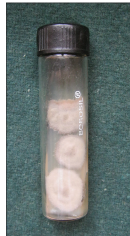
Figure 2: Fungal colonies with white aerial hyphae and black reverse