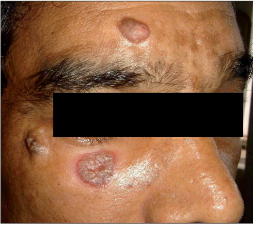
Figure 1: Plaque like lesions over the face