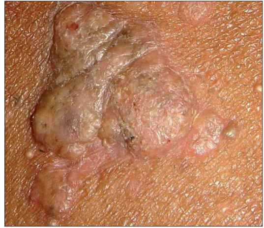
Figure 2: Nodular lesion over the back