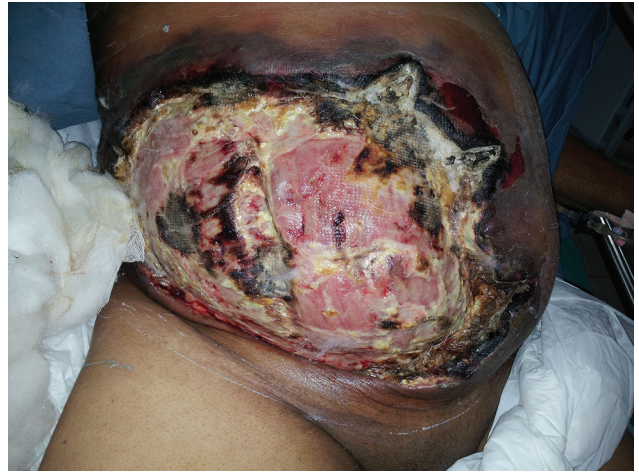
Figure 2: Extensive anterior abdominal wall necrosis, blackened edge of the lesion