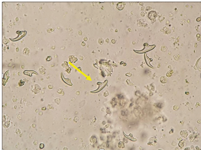
Figure 2: Photomicrograph (Wet mount microscopy) showing several hooklets (yellow arrow) of Echinococcus granulosus .

surgery is required in lesions more than 14cm in size. [16,19] However, percutaneous treatment is done in Gharbi type 1 and 2 and no treatment is required in Gharbi type 5. Appropriate scolical agents, like 10% povidone-iodine or 3% hypertonic saline, must be used during surgery to prevent anaphylaxis and distant seeding of the disease. Gentle and meticulous dissection is imperative with complete excision where ever possible. Postoperatively, the patients are treated with albendazole (dose: 10 mg/kg/day) for 3 months to prevent a recurrence. [16,19,20]