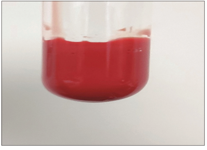
Figure 1: Vacutainer with cherry red blood sample sent for complete blood count analysis.

The infant improved symptomatically and was discharged after a week of hospital stay. The parents were advised on weaning and low-fat diet in complementary feed. On review after 2 weeks, the infant was doing fine. A blood sample for deoxyribonucleic (DNA) analysis to rule out glycogen storage disease or hyperlipoproteinemia was sent to an outside