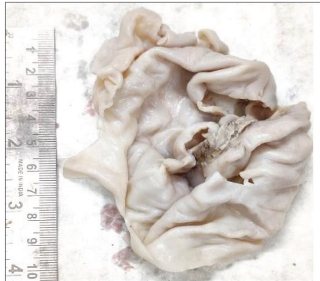
Fig. 2 Unilocular, thin-walled cyst.

were present at the periphery. Based on these findings, a diagnosis of serous cystadenoma with multiple cystic follicles was made. The baby was followed up at 6 weeks and till 6 months thereafter with uneventful postoperative recovery.