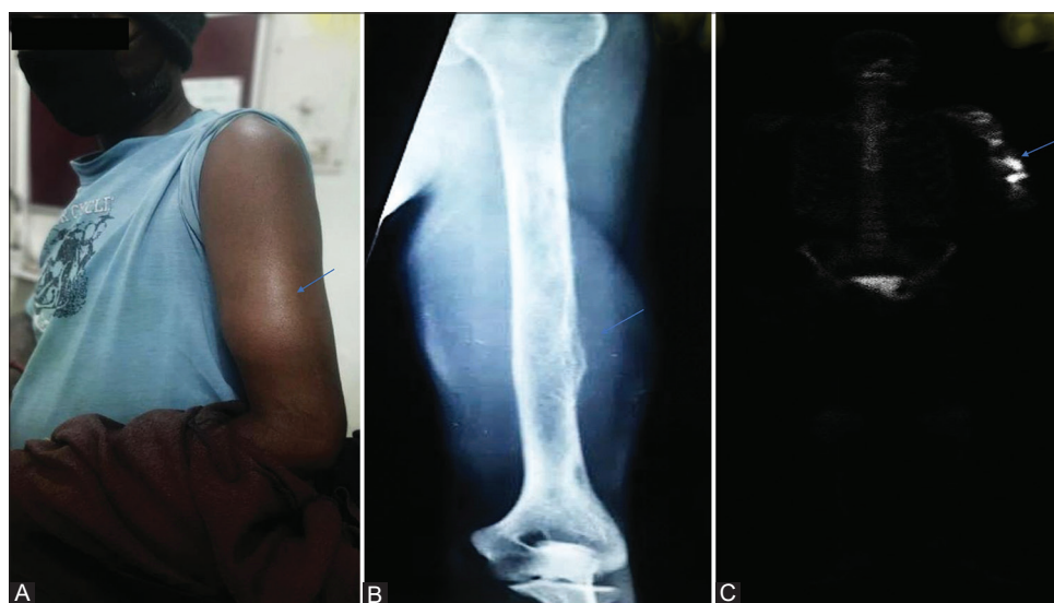
Figure 2: (A) Clinical photograph of the patient. (B) X-ray of the left arm. (C) Fluorodeoxyglucose positron emission tomography-computed tomography whole body imaging.