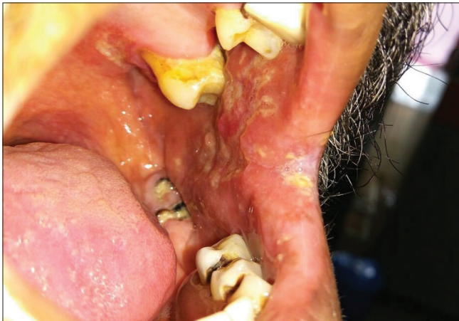
Figure 1: Ulcer in the right buccal mucosa extending to the right labial mucosa

The differential diagnoses of TCO are deep fungal diseases, chronic traumatic ulcer, granulomatosis with polyangiitis, and squamous cell carcinoma. [3] In the present case, biopsy established the diagnosis of TO, which was confirmed by RT-PCR. About 95%–98% of multibacillary cases and 48%–53% of paucibacillary cases can be detected by culture and nucleic acid amplification