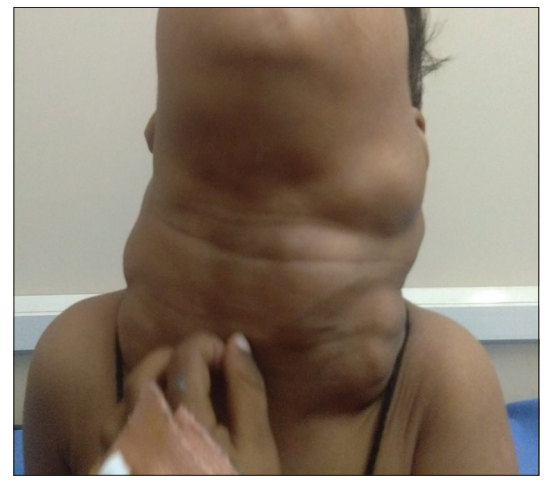
Figure 1: Clinical image showing multiple enlarged cervical lymph nodes

FNA done from bilateral cervical lymph node swellings revealed blood mixed aspirate. Smears prepared were cellular and showed numerous singly scattered histiocytes [Figure 2a]. These histiocytes were larger with abundant foamy cytoplasm, ill-defined cytoplasmic margins, central to eccentrically placed nuclei with marked anisonucleosis, finely granular to coarse chromatin,