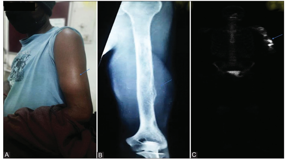
Figure 2: (A) Clinical photograph of the patient. (B) X-ray of the left arm. (C) Fluorodeoxyglucose positron emission tomography-computed tomography whole body imaging.