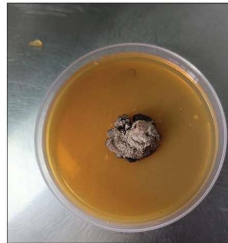
Figure 2: Culture of Medicopsis romeroi on Sabouraud dextrose agar.

Direct microscopy of the samples revealed pigmented septate hyphae. The culture showed growth of a gray-to-black colony after 72 h of incubation. The culture was non-sporulating when examined microscopically with lactophenol cotton blue mount. DNA sequencing of the ITS4 and ITS5 regions identified the mold as M. romeroi [Figure 2].