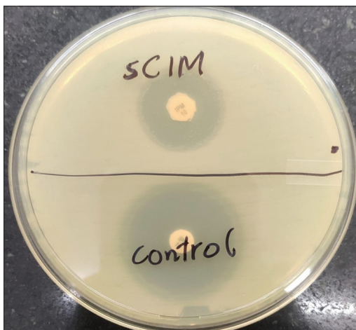
Figure 1: Visualization of simplified carbapenem inactivation method testing of carbapenem-resistant Enterobacterales isolate: Imipenem disc (10 µg) with test strain smearing alongside the control disc with no bacterial smearing (for comparative analysis). sCIM: Simplified carbapenem inactivation method