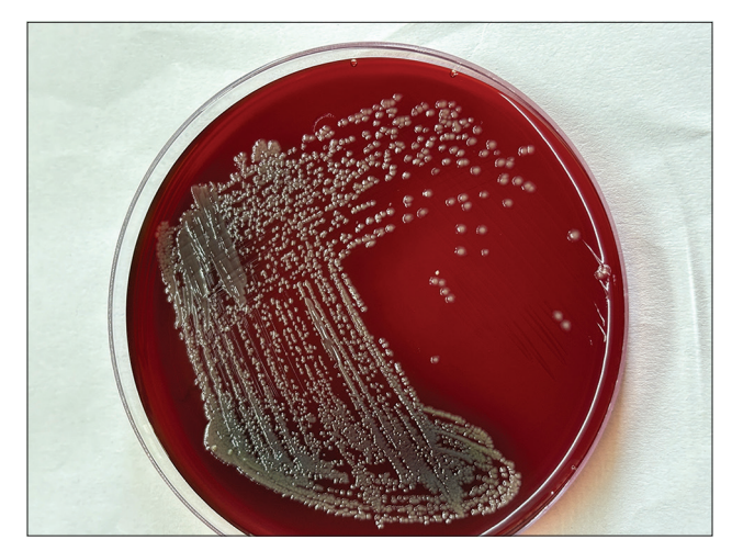
Figure 2: Colony of Burkholderia pseudomallei bacteria on sheep blood agar after 48 h of incubation.

Antibiotic therapy was changed to intravenous meropenem and continued for 2 weeks. The pigtail catheter was removed after 2 weeks and tab. cotrimoxazole for 20 weeks was prescribed, and the patient was discharged under satisfactory conditions. The patient was advised to follow up. After this, he followed up in the months of June and July 2024 and