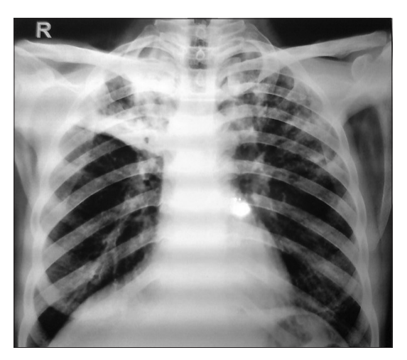
Figure 1: Chest X-ray showing bilateral upper zone opacities