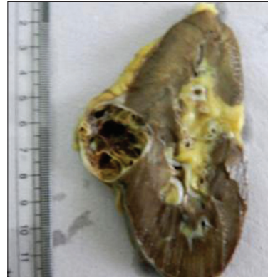
Figure 1: Left nephrectomy specimen showing an encapsulated growth with multiloculated, cystic growth. The cysts are filled with gelatinous material and are separated by thin septae

cystic nephroma may have atleast some clear cells lining the septa, the lining clear cells tend to be focally rather