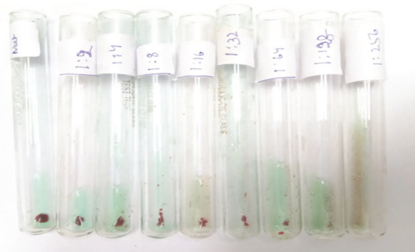
Fig. 3 Titer of mother of DTT treated serum with 5% pooled A1 cell suspension. DTT, dithiothreitol.