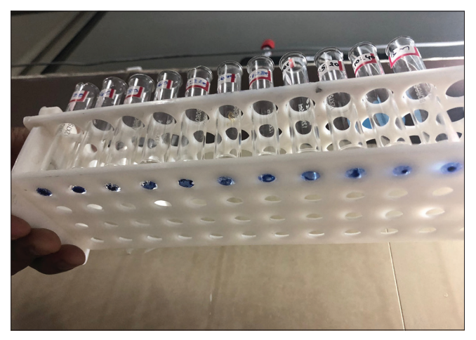
Figure 3: Standard agglutination test for brucellosis

Antibiotics were not changed due to unavailability of the reports. Gangrene was nonsalvageable which involved thrombosis of arteries and veins. The patient in due had an episode of bradycardia with desaturation, and in spite of best resuscitative measures with three doses of