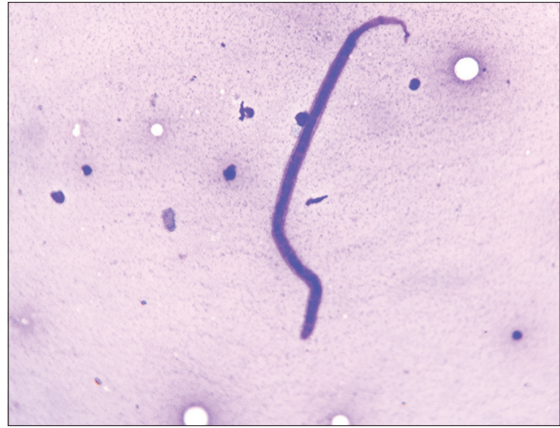
Figure 2: Smear shows microfilaria of Wuchereria bancrofti in pleural fluid cytology smear (Leishman and Giemsa stain, high power view)

species identified. [5,6] Microfilaria is occasionally identified in cytology smears. Aspirates from lymph nodes, subcutaneous nodules, breast, and hydrocele fluid containing microfilaria are infrequently reported from the endemic region. [2,5,6] The presence of microfilaria in association with malignant lesions also documented in cytological evaluation. [2,5] However, pleural effusion as sole manifestations of filariasis is very rare. [4,6]