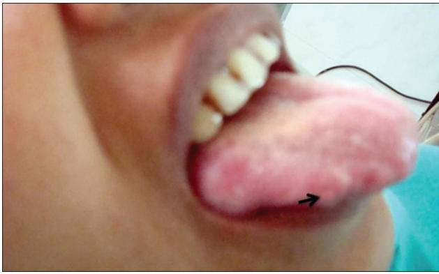
Figure 1: Swelling right lateral border of tongue (arrow)