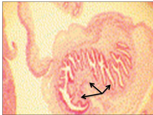
Figure 4: Cystic cavity containing cysticercus cellulosa larvae (H and E, 10x)

lives in small intestine of man measuring 2-3 m in length with 800--900 proglottids. Each gravid segment contains about 50,000 eggs. The worm sheds gravid segments with eggs in the stool infecting pig and man. On reaching the alimentary tract of pig, the eggs rupture, liberating the oncospheres which penetrate the gut wall and reach the systemic circulation. They dislodge into different organs and muscle developing into larvae. Human beings are infected by eating raw contaminated pork containing cysticerci, which develops into adult tapeworm in the jejunum. Autoinfection may also occur by contaminated fingers or direct contact with another human carrier. [5,7] The worm sheds gravid segments laden with eggs in stool, reinfesting pigs and thus completing the cycle. These are partially digested in stomach, evolving to oncospheres and subsequently penetrate small intestine mucosa to disseminate throughout the body via arteriovenous and lymphatic channels. The clinical manifestations depend on location and number of cysticercosis at particular site. Intestinal infection by Taenia solium could be asymptomatic or may present with epigastric pain, nausea, and loose motions. In the case of neurocysticercosis, a patient presents with seizures and the other symptoms are related to the location and pressure caused by cysticerci in particular the region of the brain. Oral and subcutaneous